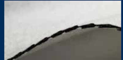
TenCate Polyfelt® DC

TenCate Polyfelt® DC are geocomposites comprising a geonet and a filter geotextile on one or both sides. The geonet is made from high density polyethylene (HDPE) and the filter geotextile from polypropylene (PP). They have a very low compressability, resulting in high discharge capacity even under high surcharge load. They are used in all kind of surface drainage applications.